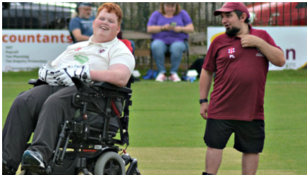
Somerset Disabled CC Players