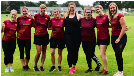
Horton & Broadway Softball