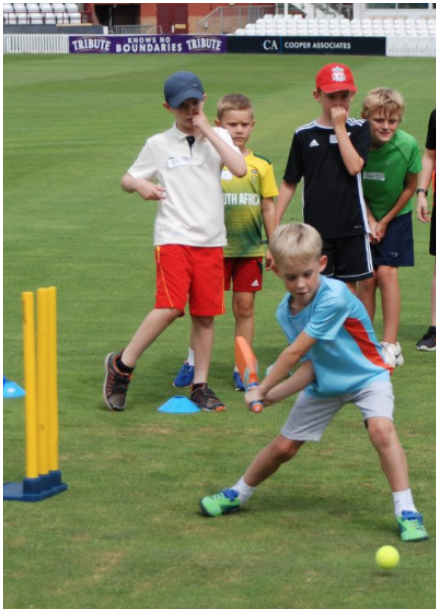
Children's Holiday Camp at CACG

The goal of this EDI Strategic Delivery Plan is that everyone can clearly identify how they can make a positive change to consider EDI in the way that they work. The overall mission of our EDI Strategic Delivery Plan is for the Club and Foundation to be a place where everyone is respected and has a high degree of belonging, are safe and supported, and diversity is both celebrated and used to support the growth our organisations. This mission is supported by a SMART action plan as outlined in Section 7 of this strategy. These will help us achieve continuous improvement on the EDI agenda – to help ensure everyone counts.