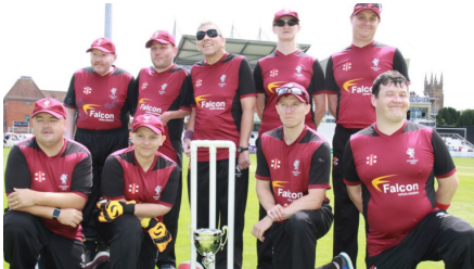
Somerset Visually Impaired CC at CACG