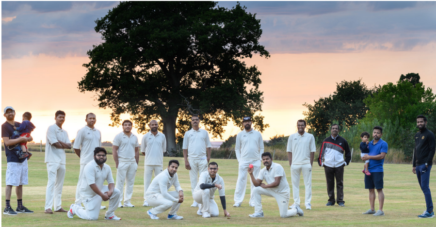
Yeovil Royal Blasters

The activity of our EDI Strategic Delivery Plan has both an internal and inward-facing focus as well as an external and outward looking emphasis. Whilst we will work to learn from, and support, our staff at all levels, we also have the opportunity to work with external stakeholders and partners – to learn from them, work with them and collaborate with them on EDI. Key partners include our local community groups, city and county councils, schools, colleges and universities.