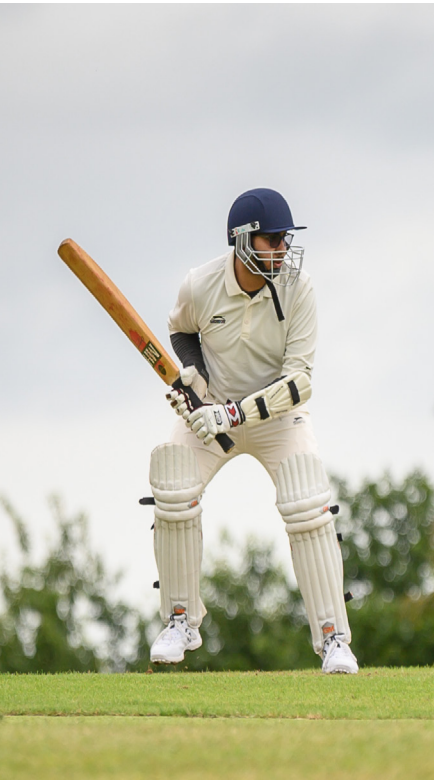
Action from the Yeovil Royal Blasters

The themes and actions proposed in our Strategic Delivery Plan are just the start; they are intended to enable us to make rapid progress on operational processes where this is possible, and also begin a longer journey to culture change.