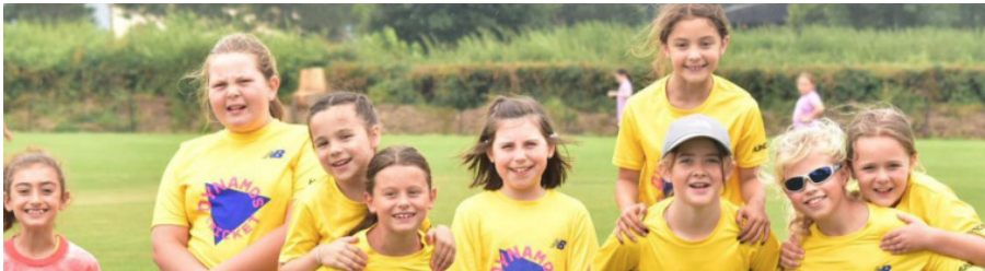
Girls Dynamos at Taunton Cricket Club

All members of Somerset County Cricket Club and Somerset Cricket Foundation will work with their strategic and operational teams/managers to identify how they can prioritise and deliver activities in support of EDI. All will have specific objectives related to EDI.