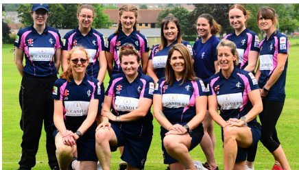
Illminster Ladies Softball

"To provide Women and Girls with opportunities throughout our network to participate in cricket in a variety of environments and levels. To ensure females can access courses and can develop throughout our sport in a range of different roles."